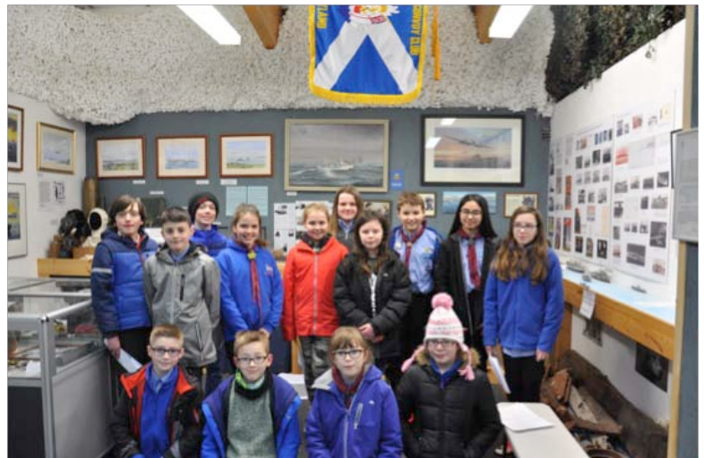
Local Air Scout Troop visit February, 2018

The Charity has recently (November 2017) become a Scottish Charitable Incorporated Organisation (SCIO) with a new Constitution. New Charity No.SC047909. At the next AGM, expected to be in June 2018, a number of the Committee will be standing down, leaving vacancies. All of the current Committee have served for many years. This is recognised not to be a healthy way to run the management of any organisation. Without a new Committee and a more active Membership and