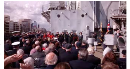
Crowds assembled for the celebrations.

For almost 2 years she served in the Arctic defending the convoys that bought aid and support to our hard-pressed allies in Russia. She