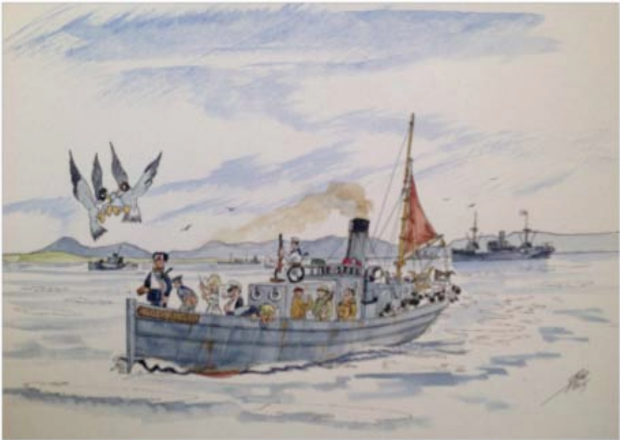
“To the Rescue”