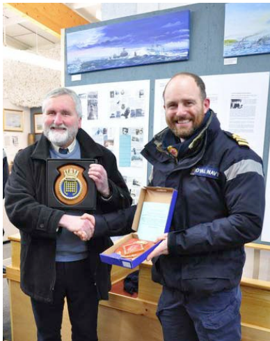
Plaques being exchanged

The visitors were most impressed with the EC's collection and the visit provided some valuable publicity for RACP and also new contacts in the Royal Navy. It is hoped that other RN ships heading north will also call in for a visit. As mentioned above, HMS Westminster was