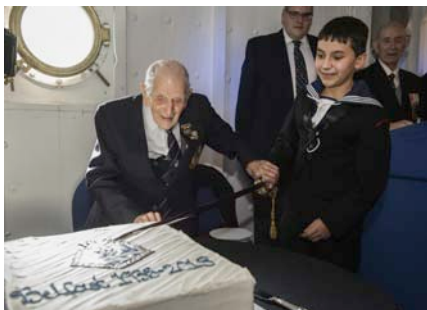
The cutting of the birthday cake.